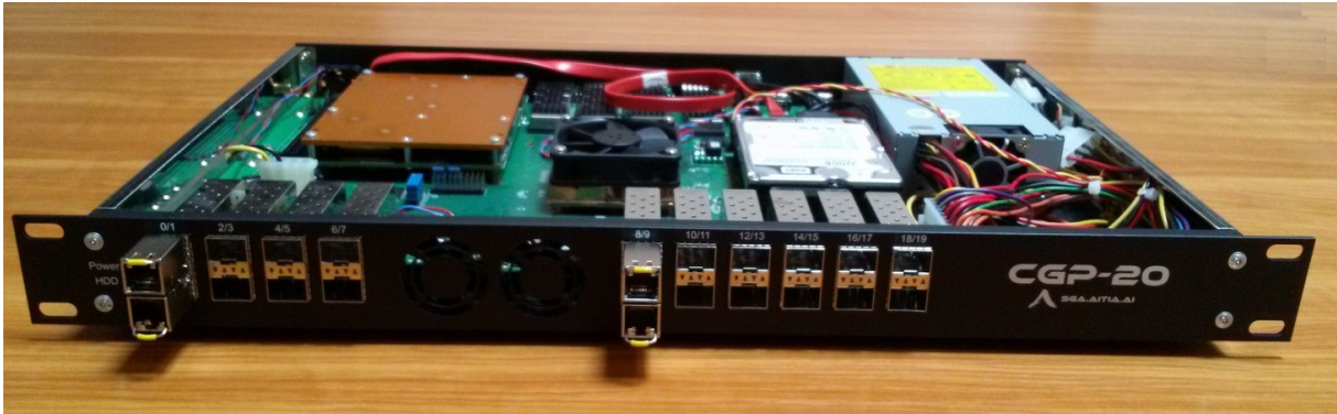
1. Fig. – Front view, C-GEP 20 prototype (without cover)