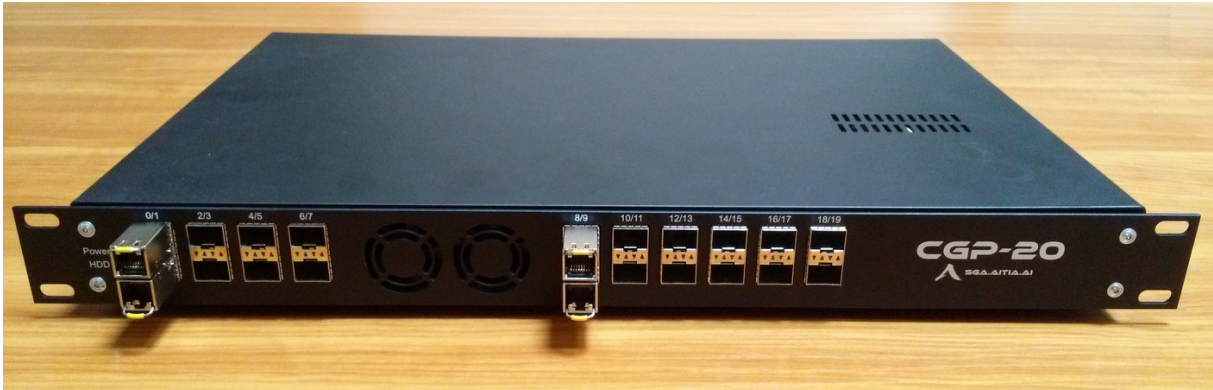
2. Fig. – Front view, C-GEP 20 prototype (with cover)