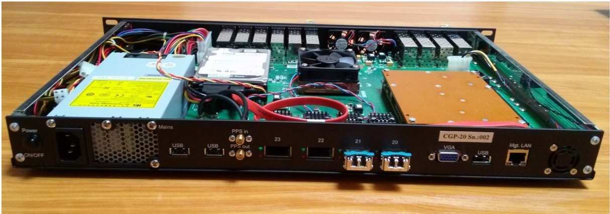
3. Fig. – Back view, C-GEP 20 prototype (without cover)